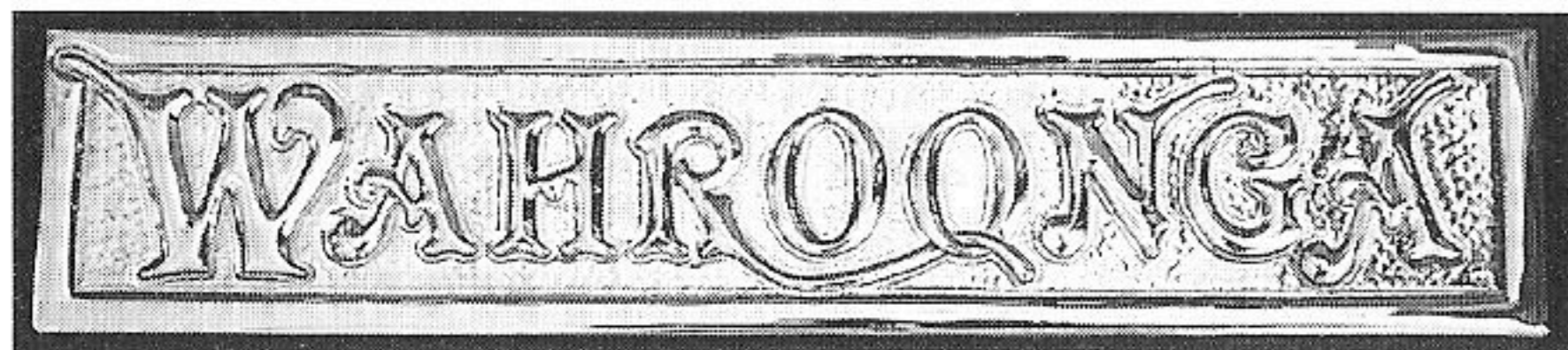
Traditional with Victorian lettering