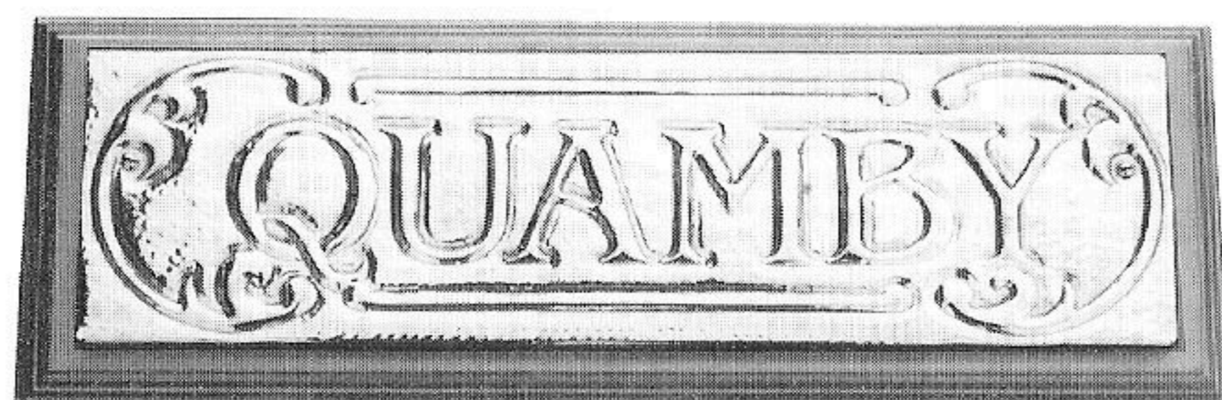
Hanover with Bangkok lettering

House Numbers can be made to match any of our designs.