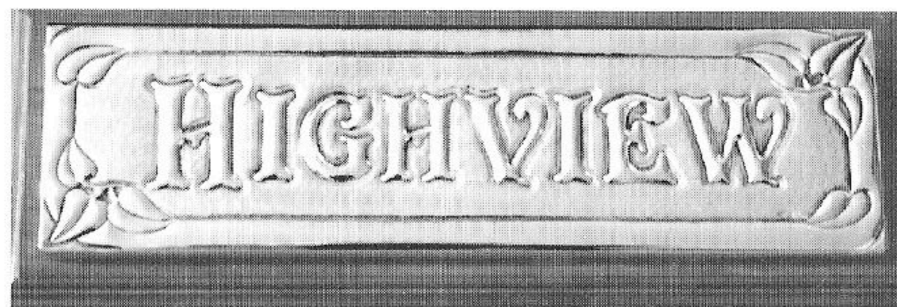
Nouveau with Victorian lettering