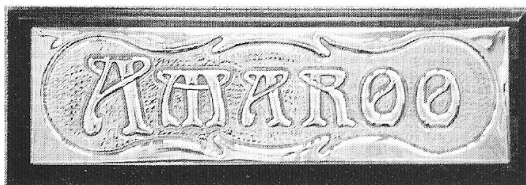
Classic with Boklin lettering