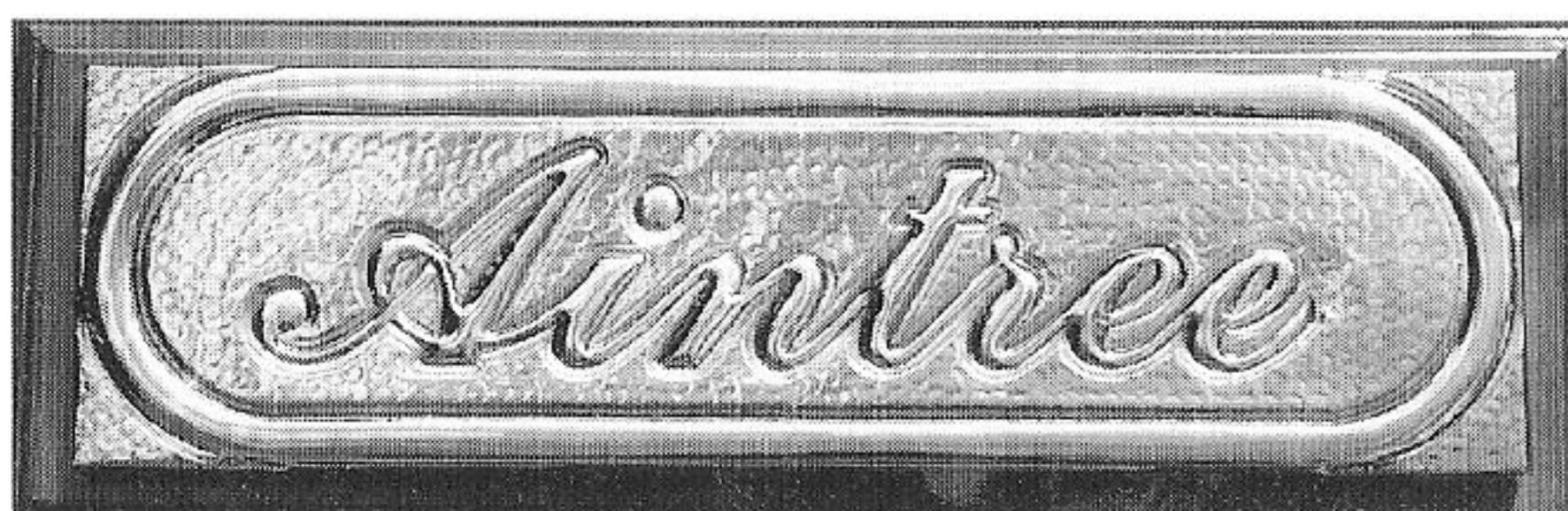
Georgian with Script lettering