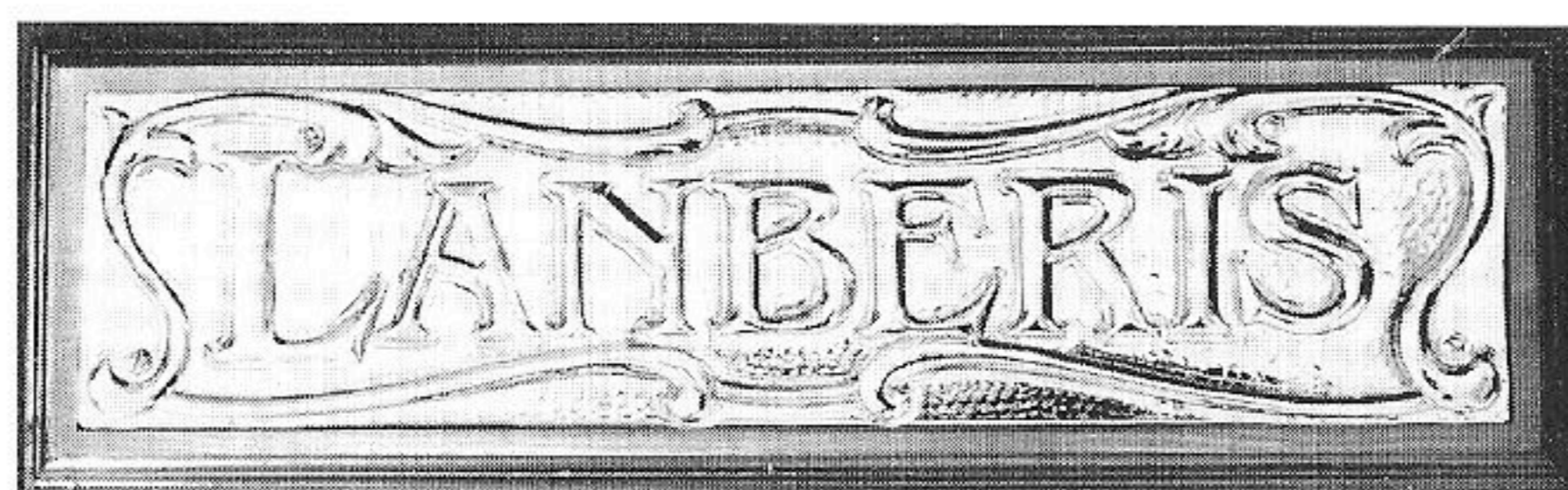
Montrose with Bangkok lettering