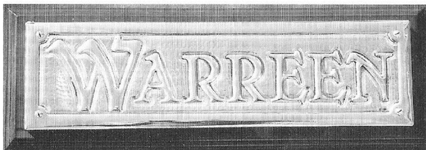
Traditional with Chesterfield lettering