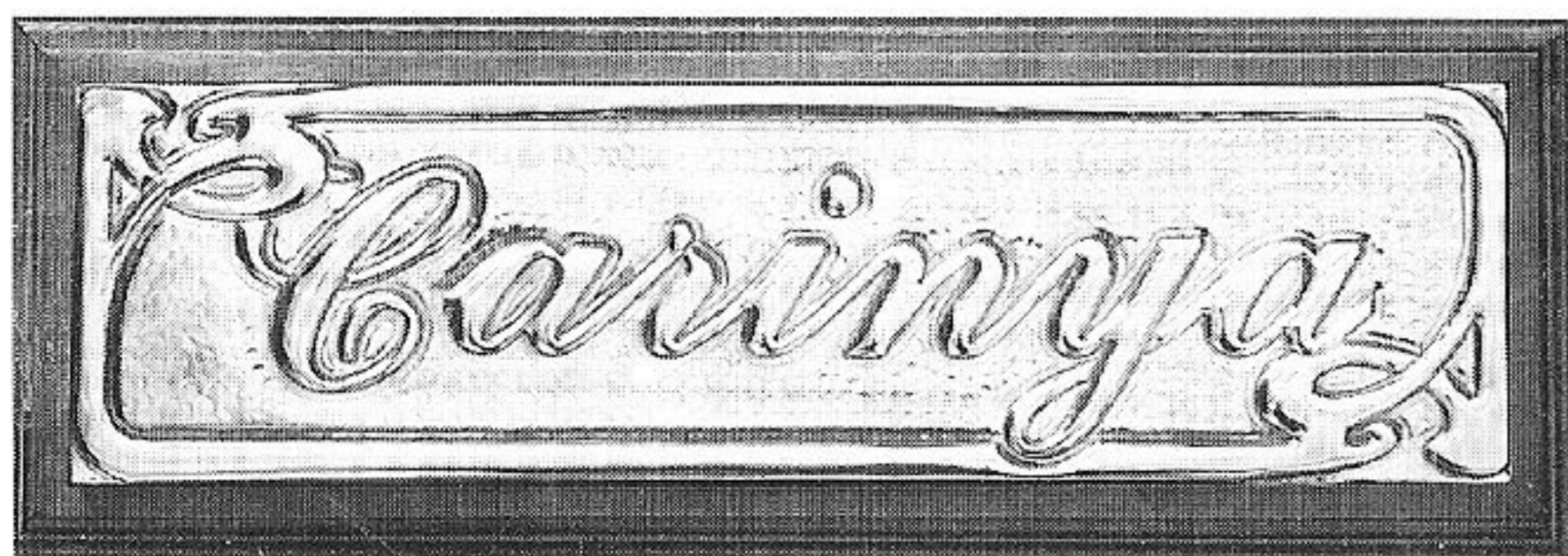
Windsor with Script lettering