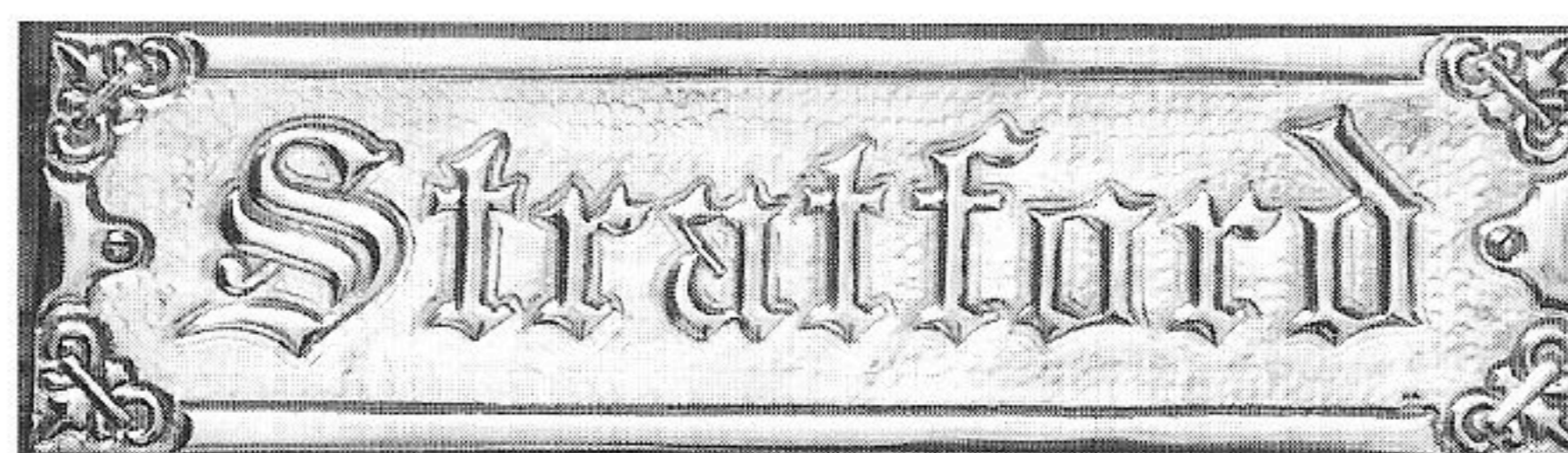
Gothic with Old English lettering